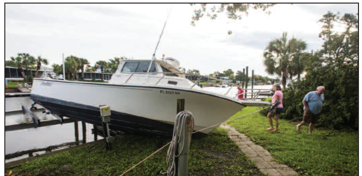
Be prepared and follow through with the South Shore Harbour Marina checklist on page 5.

More insurance companies are requiring you to submit a written hurricane plan to obtain named windstorm coverage. Make sure that if you submit one of these, you have the means to actually carry out your plan, and do it if needed. It is also recommend documenting through pic-