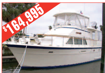
43' Hatteras 43 MY '85