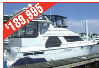
445 Carver 445 MY '97