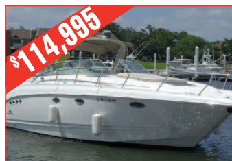
35' Chaparral 350 '05