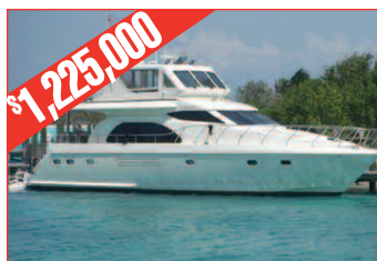
60' Hampton MY '07