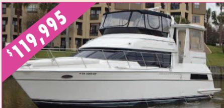
45' Carver 455 Motoryacht '98