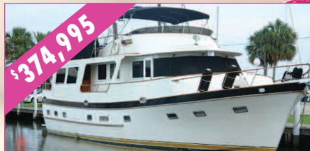
62' Med Yacht LRC '89