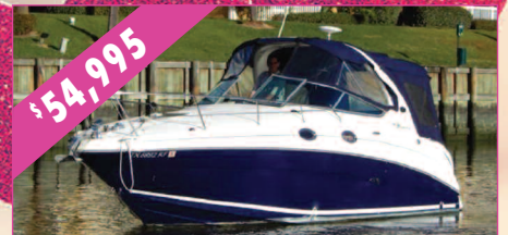
29' Sea Ray 280 Sundancer '05