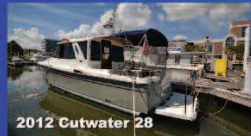
2012 Cutwater 28