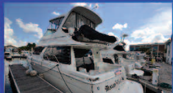
'05 Carver 46 Voyager