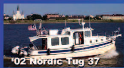
'02 Nordic Tug 37