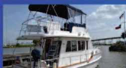
'06 Island Gypsy 32 Eurosedan