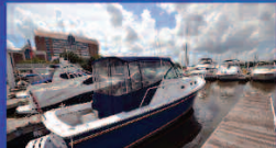
'98 Mainship Pilot 30