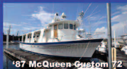
'87 McQueen Custom 72