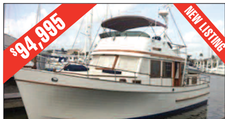
44' Marine Trader '83 Double cabin, Lehman diesels