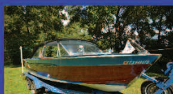
1965 Century Coronado full restoration