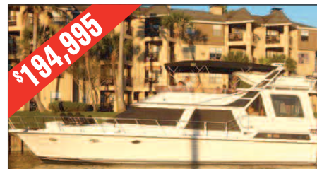
52' President Motoryacht '91