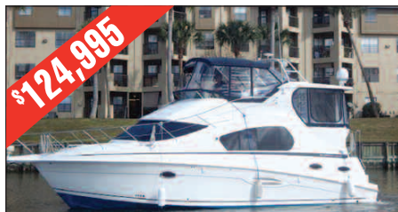
35' Silverton Motoryacht '06