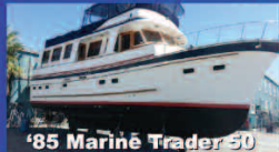
'85 Marine Trader 50