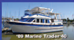
'89 Marine Trader 40